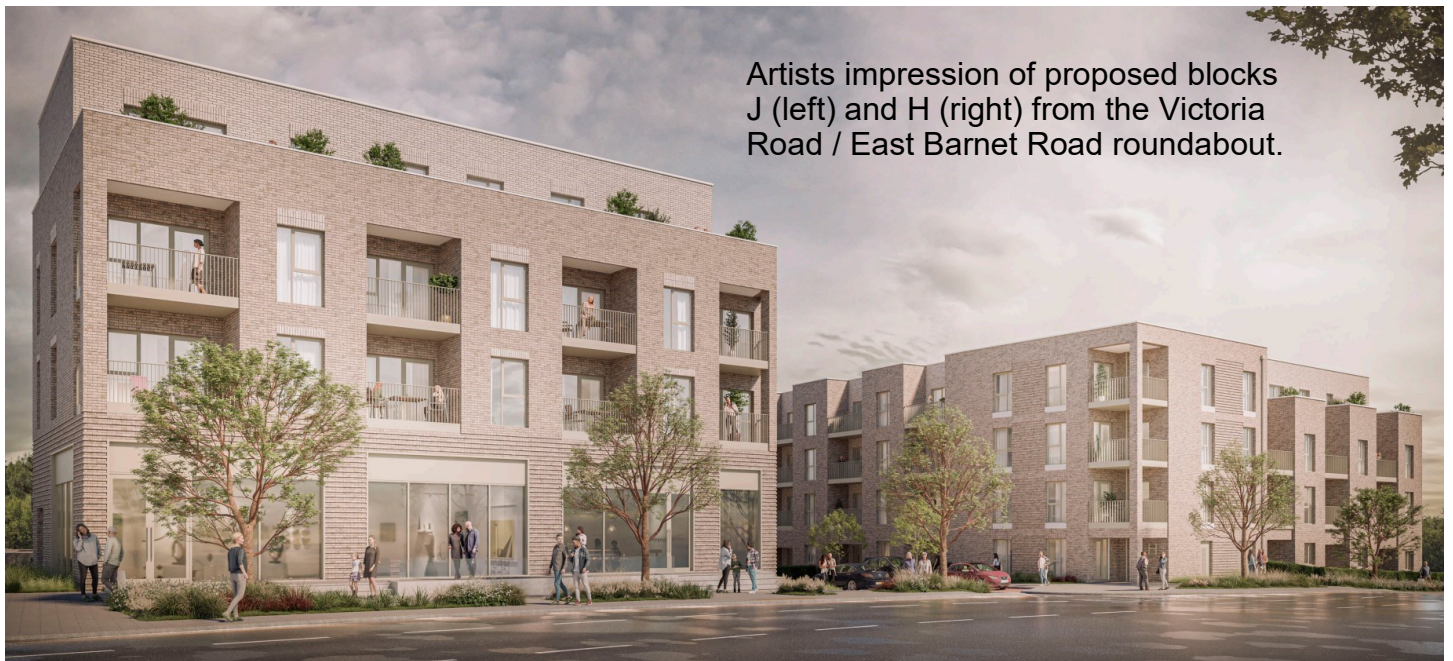
Artists impression of proposed blocks J (left) and H (right) from the Victoria Road / East Barnet Road roundabout.

All three planning applications can be examined via Barnet Council's planning website.